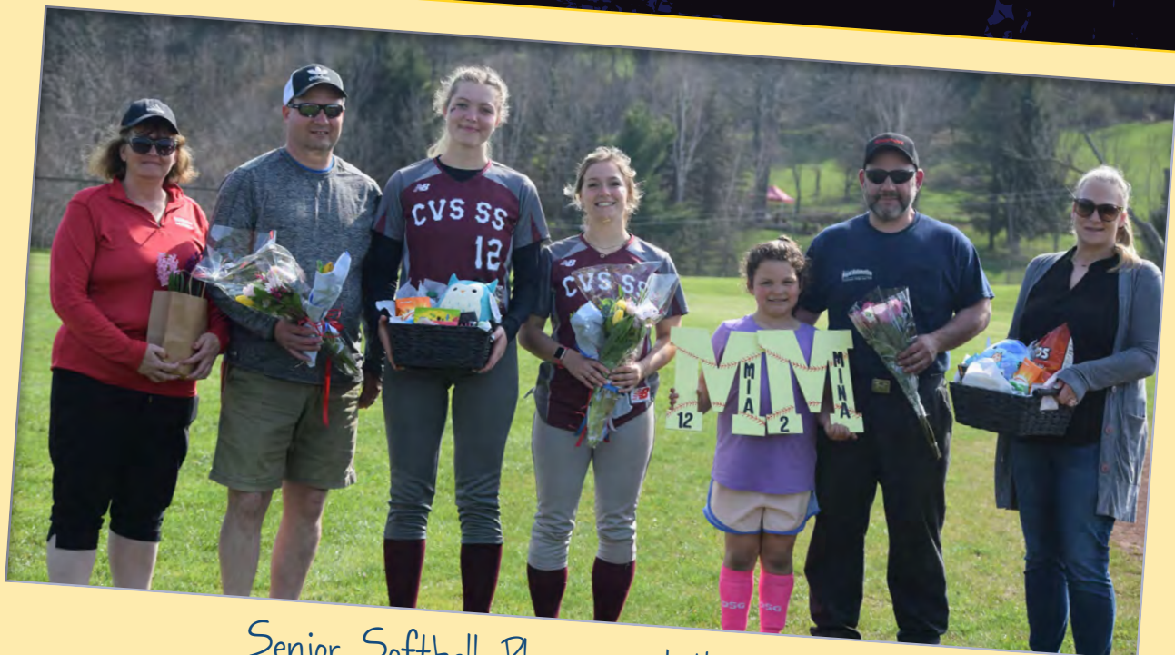
Senior Softball Players and their Families