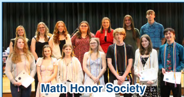
Math Honor Society