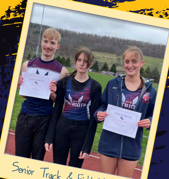
Senior Track & Field Members