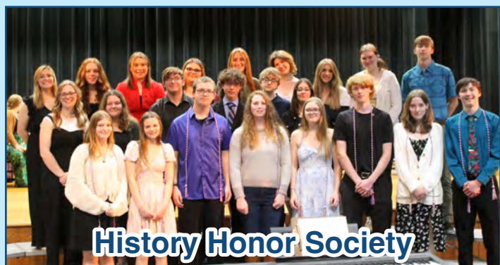
History Honor Society