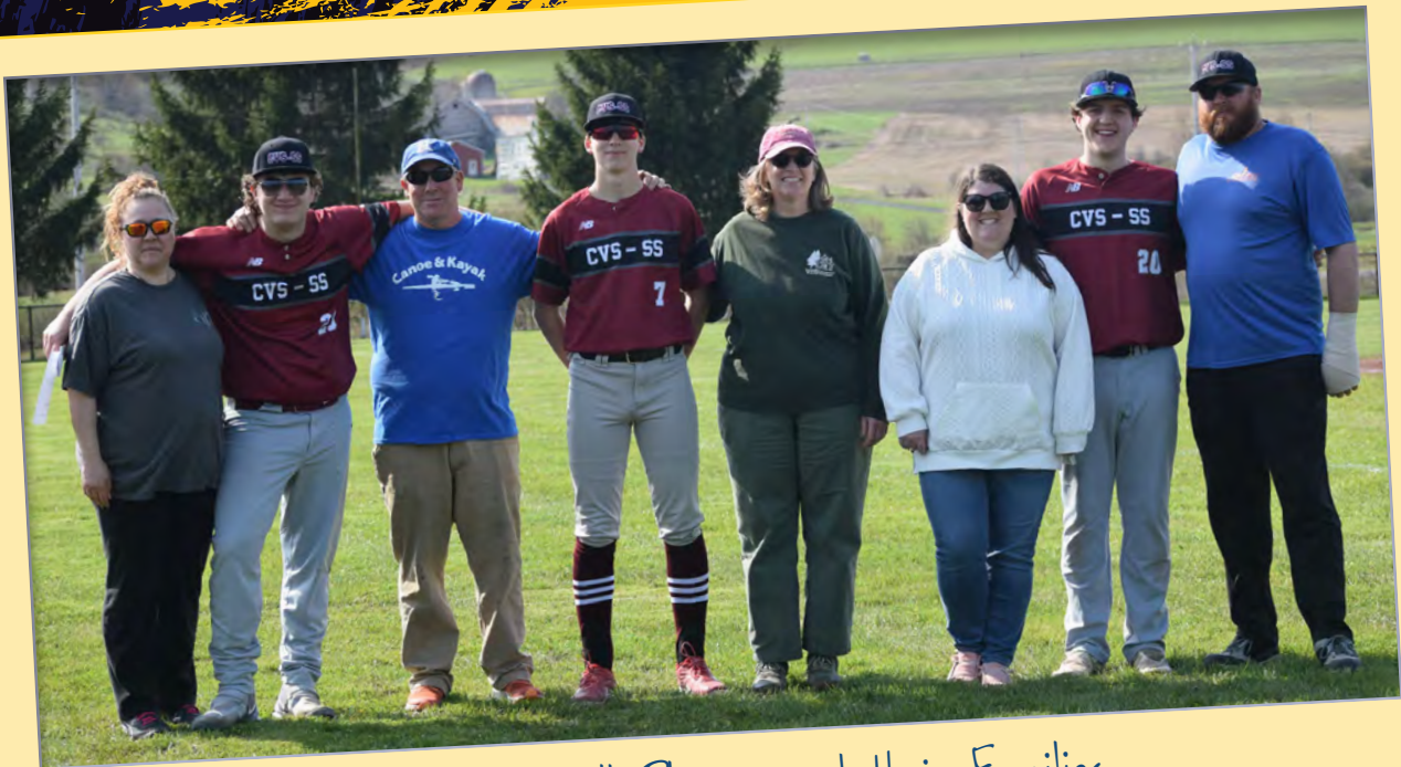
Senior Baseball Players and their Families