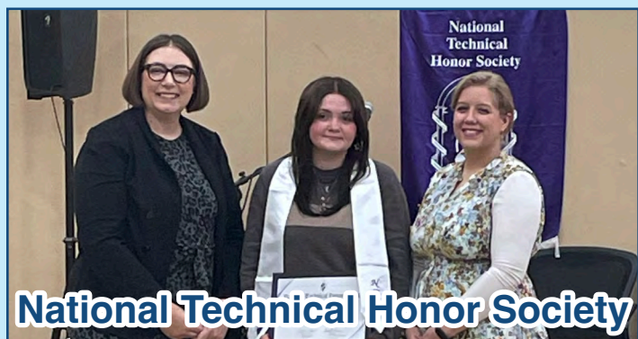
National Technical Honor Society