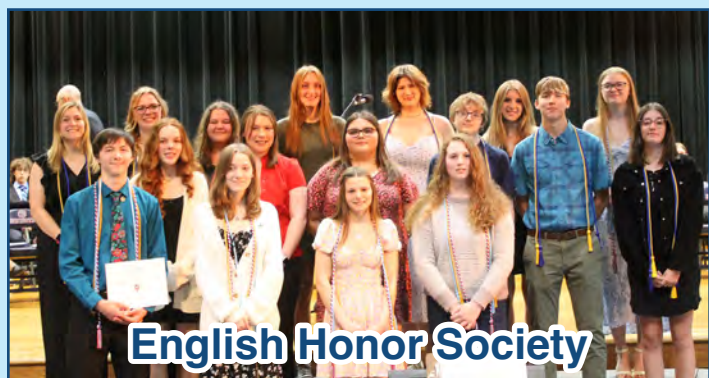
English Honor Society