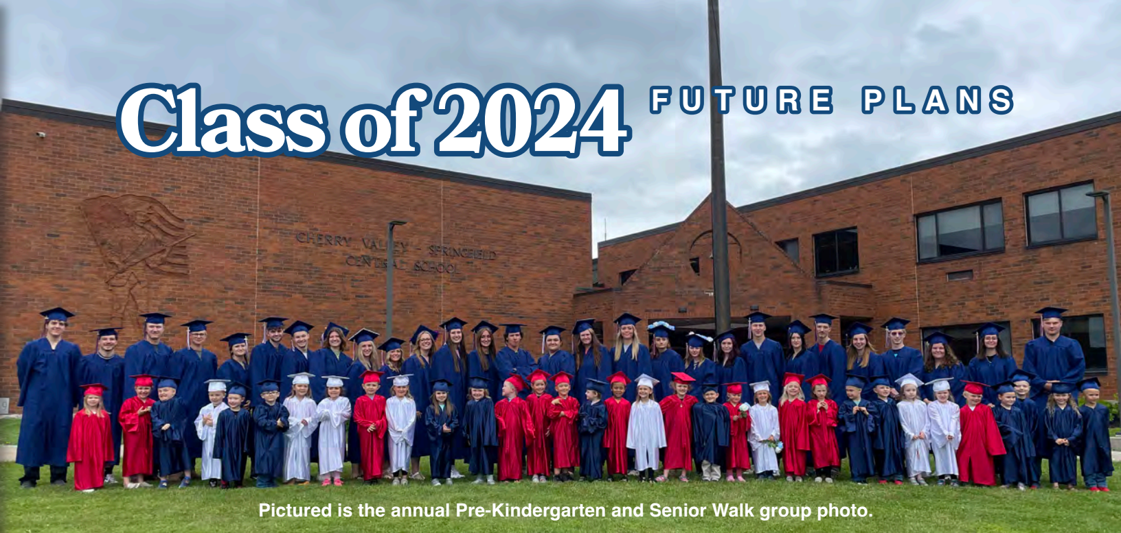
Pictured is the annual Pre-Kindergarten and Senior Walk group photo.