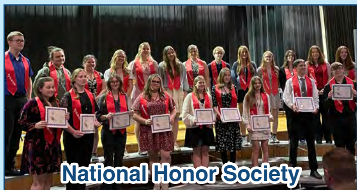
National Honor Society